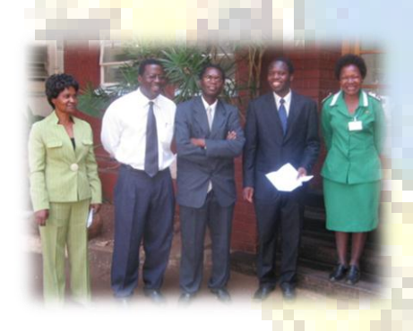
Doctors and Nurses who carried out the free eye cataract operations from Sekuru Kaguvi Hospital

The generosity and steadfast efforts of: Regency Casino, Nissan Clover Leaf Motors, Old Mutual, BancABC, Datlabs, Ernest and Young, National Tyre Services, Afre, Sovereign Health, ZB Financial Holdings, Zimnat Life, Zimnat Lion, Barclays Bank, and Ratanje Shoe Heel Bar (to mention but several) has had a great impact on our success in the fight against preventable blindness. It is through the generosity of individuals and corporates like these that we are able carry on with this service to our community.