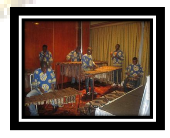
St. Josephs House of Boys Marimba Band

The club also supports St. Josephs House of boys as well as St. Giles. Every year, we host a Christmas party for them and both homes get to appreciate their differences and it is seen in the way the able bodied help the crippled from serving them food and just playing around and having a good time. We also support the St. Josephs Marimba Band by giving them exposure and opportunities to show case their talent at our annual fundraising dinner dances. We are currently fundraising for repairs of tiles in their reception area.